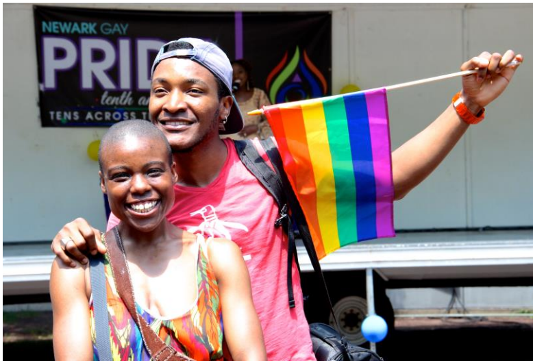
Newark Pride Festival, 2015.

piers of the Atrium's arcade, helping to direct visitors to the First Floor Gallery. Video clips with historic footage from the elaborate balls held by the LGBTQ community, part party, part community gathering, part educational center, will be shown. In the 1990s, at the height of the AIDS epidemic, events like the Fireball were places where safe sex information was available.